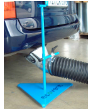
adjustable in height and angle

The car exhaust extraction systems are also available with exhaust fan made from casted aluminium or with 230V motor.