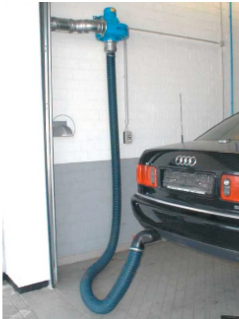
Single place system

The Single place exhaust extraction systems from ecovent are the cheapest possibility to remove exhaust gas. The kits includes complete equipment like: