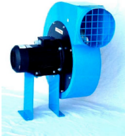
Ventilatoren Typ VB

The construction is made of powder coated steel and the impeller is made of welded aluminium. A long life industry three-phase motor moves the directly flanged impeller.